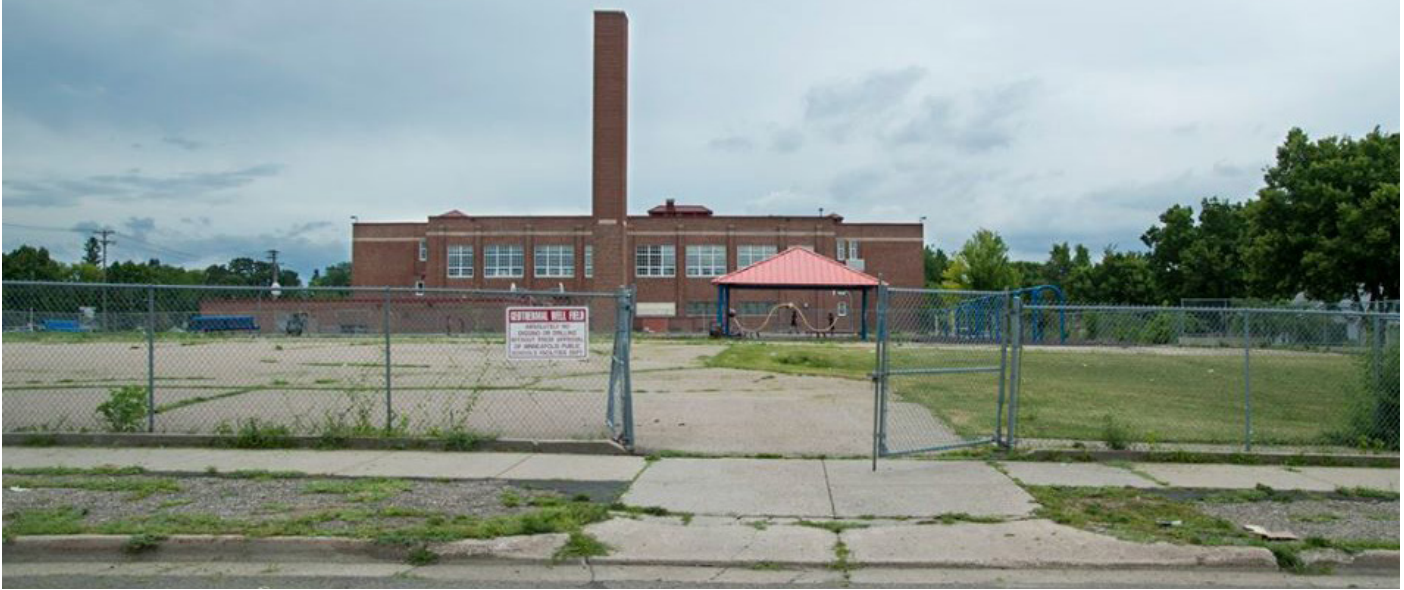
"Before" photo of Lincoln Playground, with school in background, Summer 2015

Guided by the Lincoln Playground Leadership Team, along with a group of determined residents and supporters, we cast a wide net of invitation and involvement. We believe these events resulted in improved health and wellness, enhanced the community's sense of place, and encouraged economic development and overall livability. These events were undeniably successful in drawing local interest to the site, in showing students their play space matters, and in planting the seed for a future community space. These efforts were just the beginning of the community outreach that will help to shape the larger project, which we intend to continue throughout 2017.