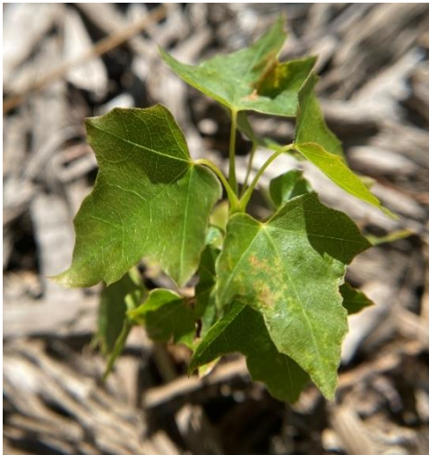
Maples ( Acer spp.)