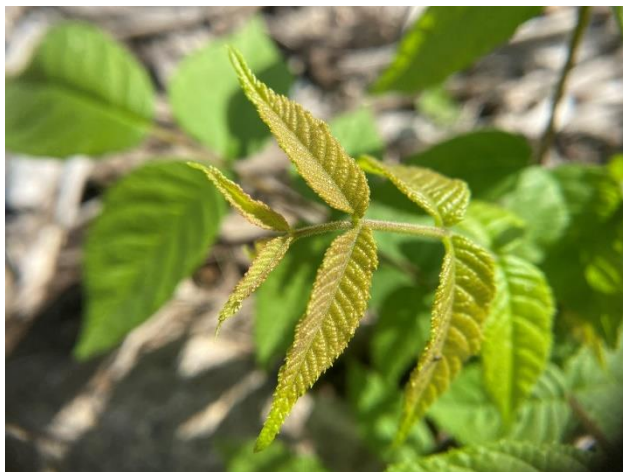
Walnut Family ( Juglandaceae )