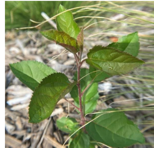
Apples ( Malus spp.)