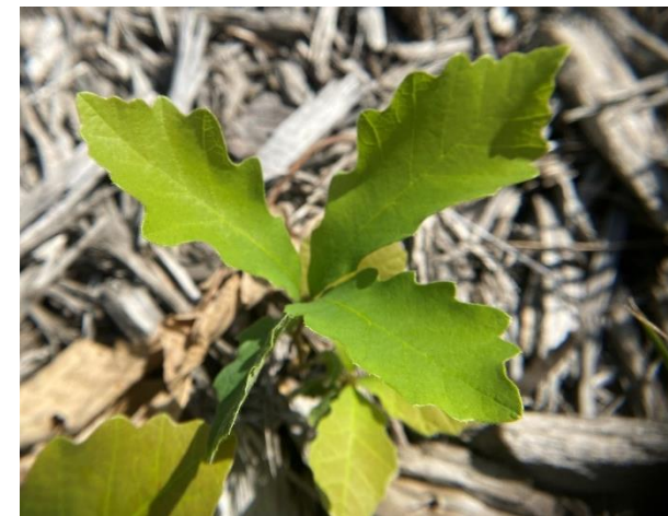
Oak ( Quercus spp.)